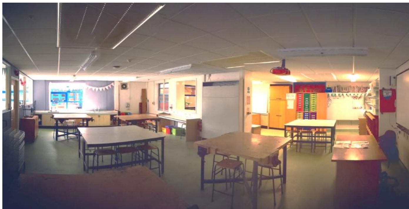
The DT Room