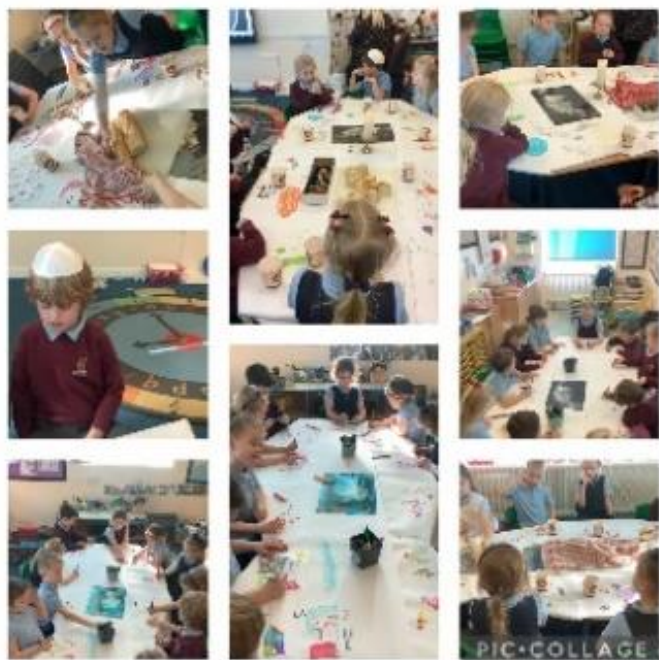
In RE this half-term, Year 1 have been investigating part of the Jewish faith and how they live and celebrate. As part of this work, the children enjoyed learning about Shabbat.