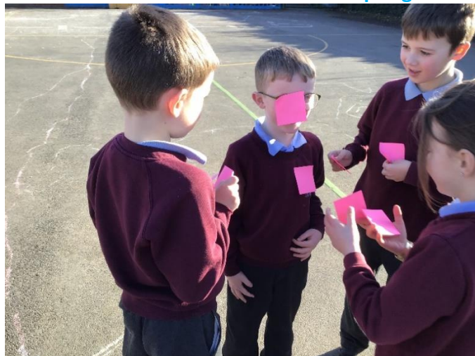
Year 3 had an exciting science lesson on the playground understanding how bees spread pollen.