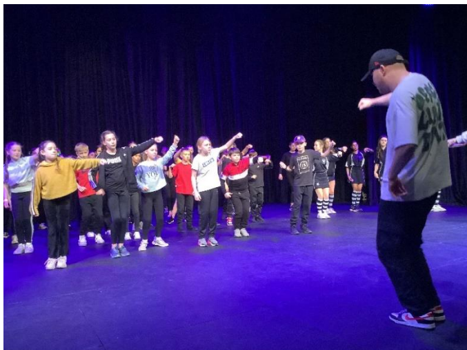
Heron class attended the Worcestershire dance festival. The children performed a dance and took part in a dance workshop run by a well-known Oddsteperz.